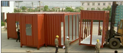
Step 2 : 4000 sq ft pre assembled in the factory