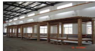
Step 5: Build kitset balconies

Step 7: Re-assemble on site and finish. (NB Of course foundations are required to be prepared when the house arrives)