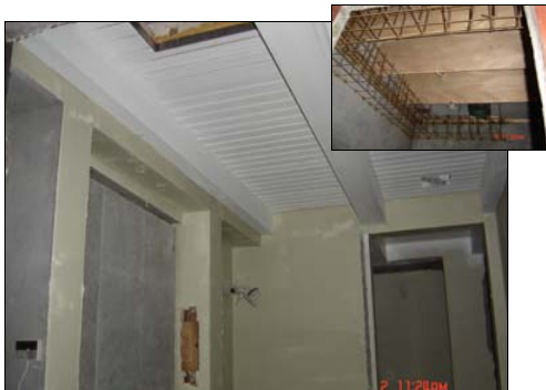
Step 3: The fit-out using the finest materials