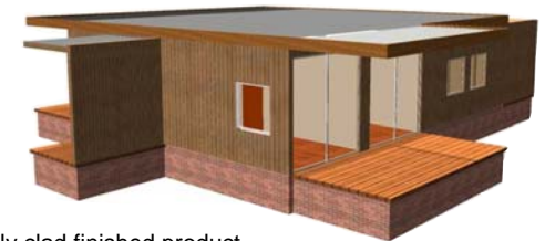
The fully clad finished product

Step 7: Re-assemble on site and finish. (NB Of course foundations are required to be prepared when the house arrives)