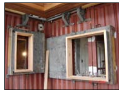
Step 4: Fit the windows